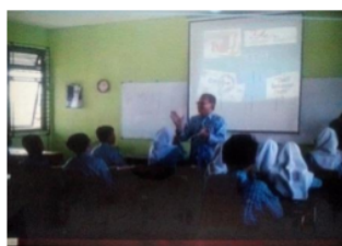
Figure 4 Energizing students by singing and various clapping hands

There were 9 activities done by the observed teacher during the third lesson. In the pre-activity, the teacher stood in front of the students and greeted the students by saying “Assalamu’alaikum”, “Are you fine today?” at the beginning of the lesson. It was very clear that this practice was not a creative one. On the next action, the teacher motivated the students by singing the song “If you are happy and you know it” together. This implementation belonged to the creative one as it functioned to prepare the students’ psychological condition before going to the main material. This action was suitable for the second indicator of creative teaching, creating new and meaningful ideas. The teacher continued energizing the students by saying “Clap your hands”, “Stop”, “Single clap”, “Double claps”, “Triple claps.” The students directly follow the teacher’s command. Since the teacher linked new ideas to others effectively, the teacher has done the fourth aspect of creative teaching. In addition, clapping hands in various ways meant that the teacher showed originality in work and it belonged to indicator 6. The situation of the teaching implementation was shown in the following figure.