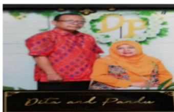
Figure 5 Teacher shows his own picture to be described by his students

the fifth and the seventh indicators, in which the teacher acted as a person who was responsive for different views and considered mistakes as an opportunity to learn. The last main activity was conducted by the students' moving the ball during the audio music performance. When the music stopped, the students getting the ball gave a short description of well-known people (the class leader, a dangdut singer, and a picture of the teacher) in the form of name, origin, profession, physical and non-physical characteristics. The idea of using dangdut music in the learning process and a very well-known characters was really a process of out of the box thinking which applies an unusual or even impossible idea as a practice of creative teaching (Sale, 2015). This activity was so creative that it fitted to all aspects of creative teaching practices. The teaching implementation during this stage could be observed from the following figure.